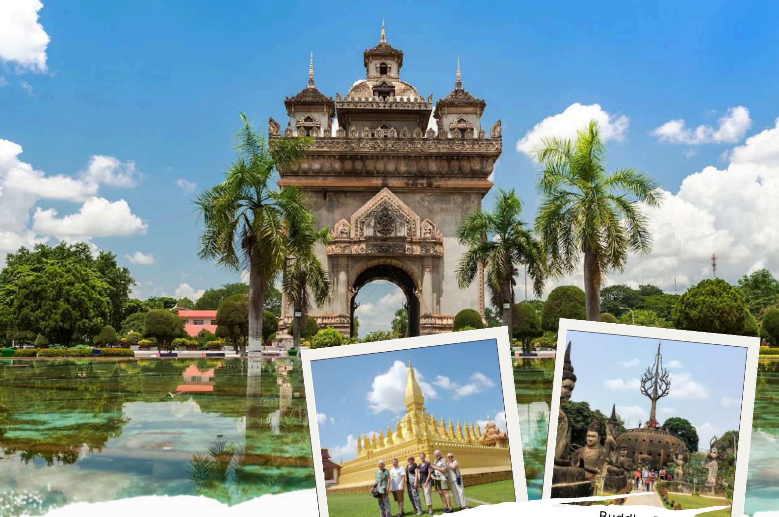
That Luang Stupa